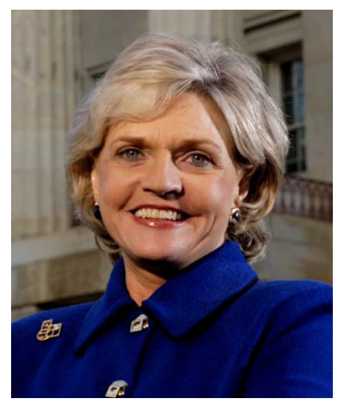
The Honorable Beverly Perdue Governor of North Carolina

Small businesses are the lifeblood of our national and state economy. The entrepreneurial spirit that propels people to create and grow new businesses has been an essential part of our growth as a state.